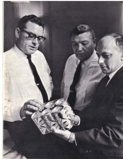
Pepsi execs examining prototype aluminum Pepsi cans in the 1960s.

New Pepsi T-Shirts are available at JC Penney and Kohl's stores.